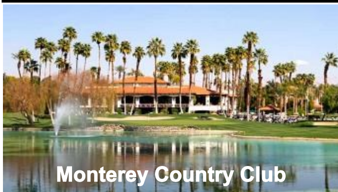
Monterey Country Club